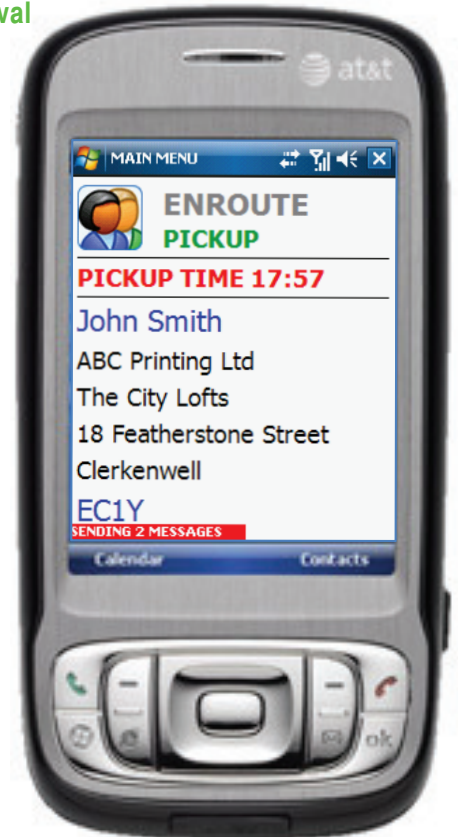
* Actual Size

Configurable Reporting of GPS Position and Driver/Job Status